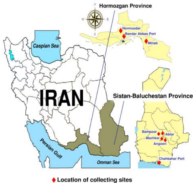
Fig. 1. Location of Anopheles stephensi collection sites from malarious areas of Iran, 2011

* RR50, Resistance Ratio at LC 50 (RR50= LC 50 of field population/ LC 50 of Beech-Lab)