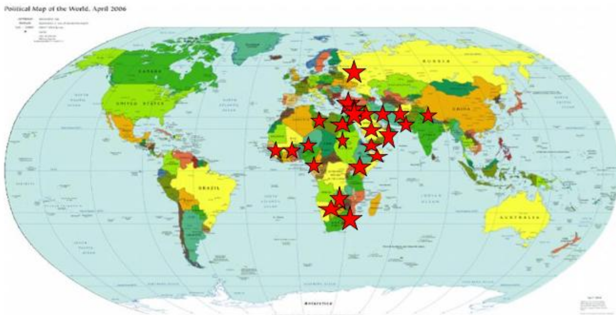
Fig. 3. Global distribution of participants from malaria courses